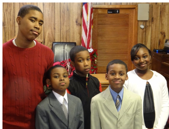
The Primary and The Junior Class